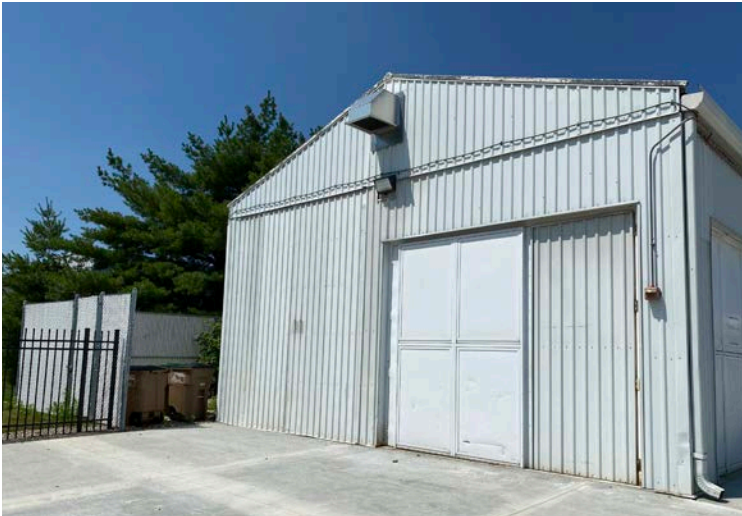
SOUTH BUILDING FACADE