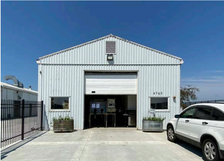
NORTH BUILDING FACADE