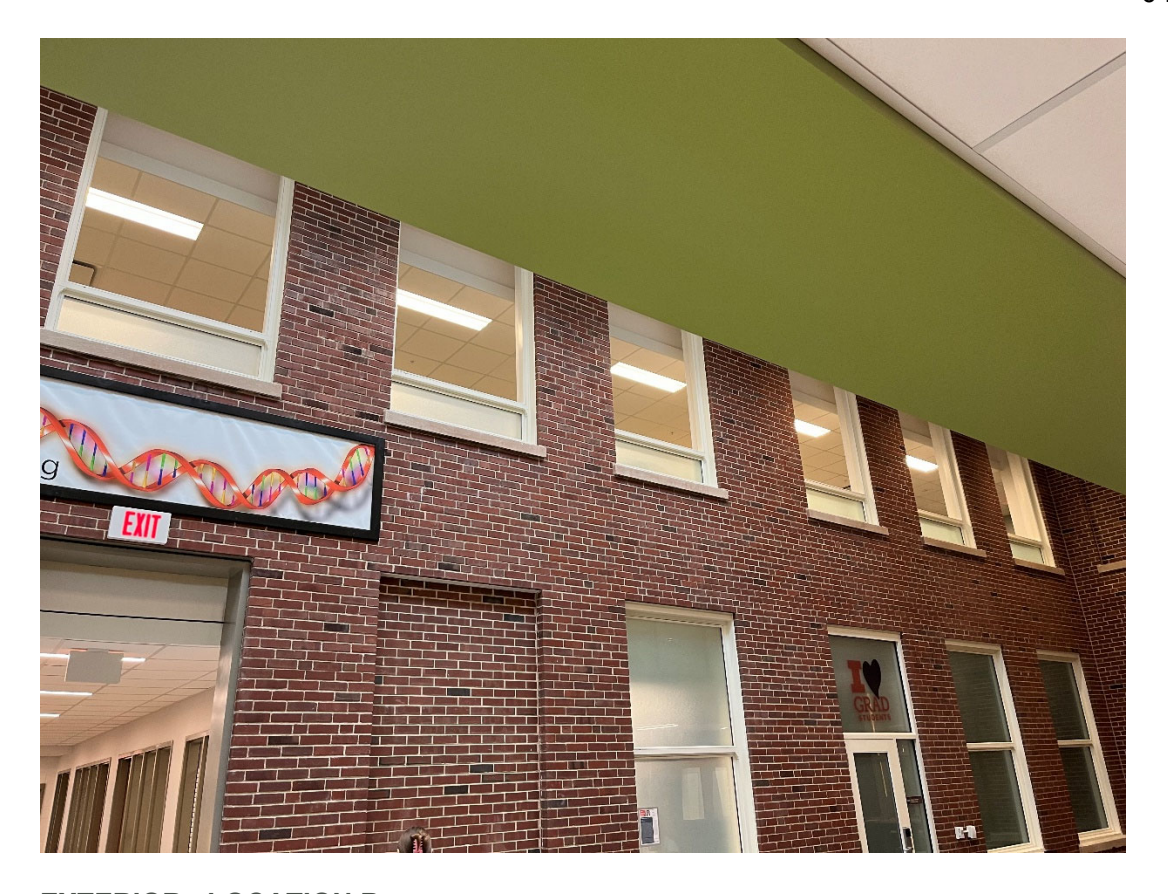
EXTERIOR - LOCATION B